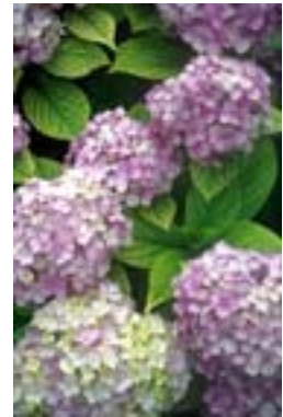
Hydrangeaceae - The Hydrangea Family

the summer. Late summer is the right time for a beautiful butterfly garden. Try growing the nectar vines; Sweet Autumn Clematis or Climbing aster or both! The Clematis flowers in August and September. It's loves full sun. It's easy to grow and is very fragrant. The Climbing aster likes sun to partial shade. It flowers in late summer into fall and grows to about 12' tall!